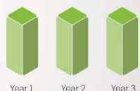
Year 1 Year 2 Year 3